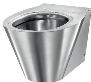
SN0128CS Satin finish